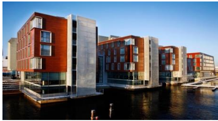
Scandic Nidelven Hotel, Trondheim Raw Air Men