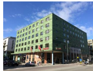
Scandic Solsiden Hotel, Trondheim Raw Air Women